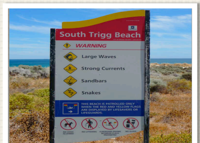
DANGER SIGNS EVERYWHERE