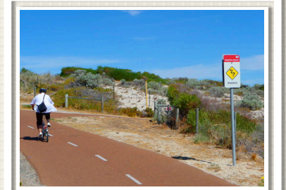
BIKE TRACK WITH SNAKES