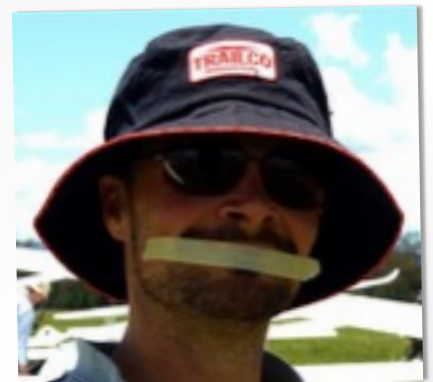
KEEPING TIGHT LIPPED