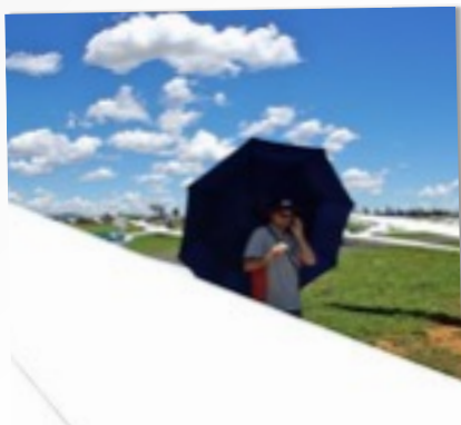
LAST MINUTE COMMUNICATION

If you are in the air for many hours far from home base you are on your own. You need to be able to read maps, understand what good terrain looks like and how long it will take to get somewhere when there is no uplifting wind to help you. Taking off and landing are other stresses that you have to master. Getting pulled up into the air may sound easier but one has to also land safely. And then there is the embarrassing question that few people ask. What if I have to go to the toilet?