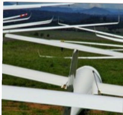
READY SET GO