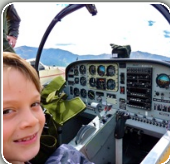
I am the pilot

Today was a great day. The NZ air force landed right next to my bedroom in the morning. There were 5 air force planes. They let me sit in the pilot seat. Then dad went off gliding.