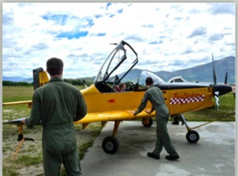
Learning to steer

The captain let me sit in the pilots seat