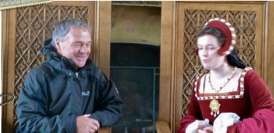
Discussing affairs of state with the Queen