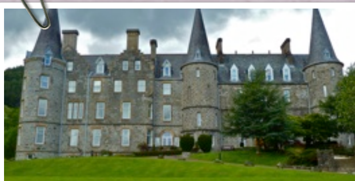
Hotel near Aberfoyle in Trochach country

Not seeing cold Iceland, now that's a real pity But it's no reason to get stressed, angry or shitty. It's other places we now have to plan Somewhere bloody warmer to get a sun tan!!!!