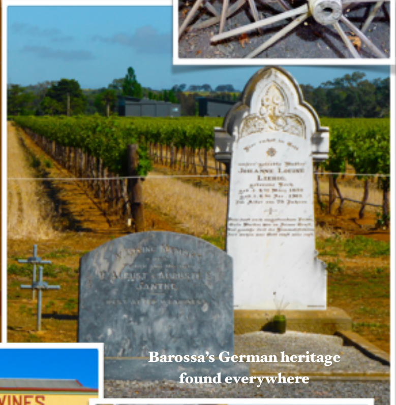
Barossa's German heritage found everywhere