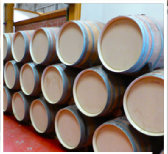
World famous Seppelts winery