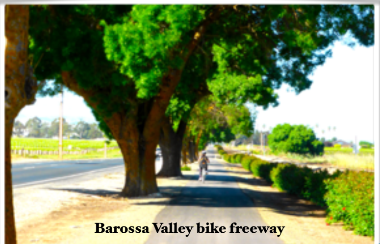
Barossa Valley bike freeway