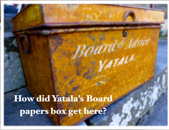
How did Yatala's Board papers box get here?