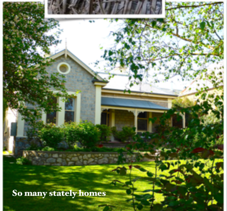
So many stately homes