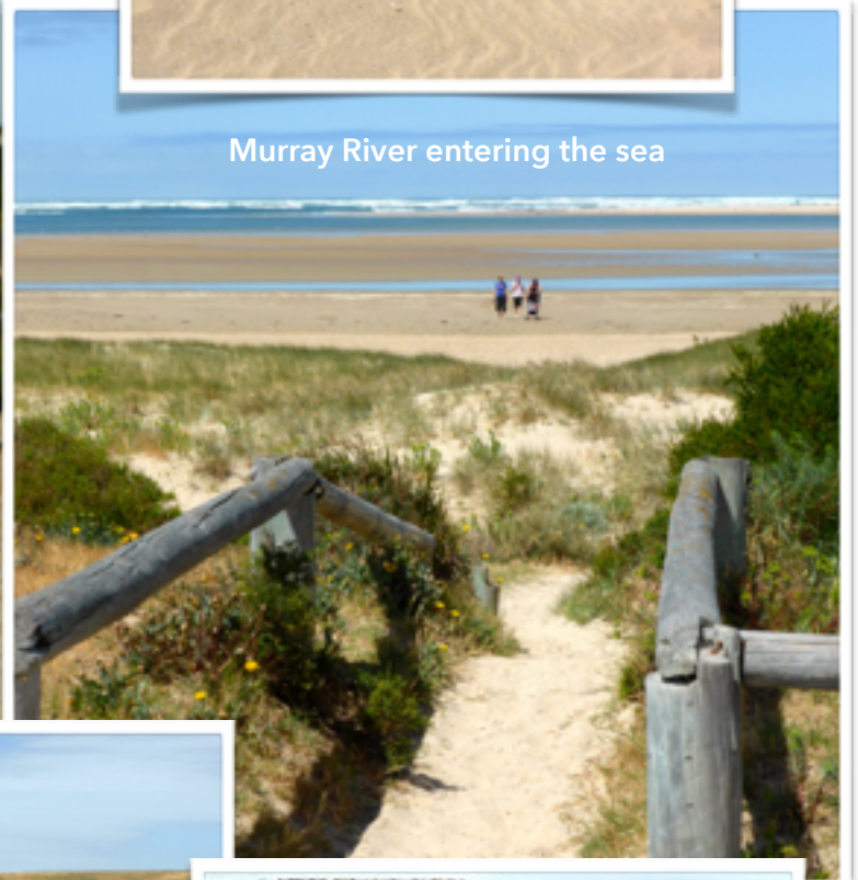
Murray River entering the sea