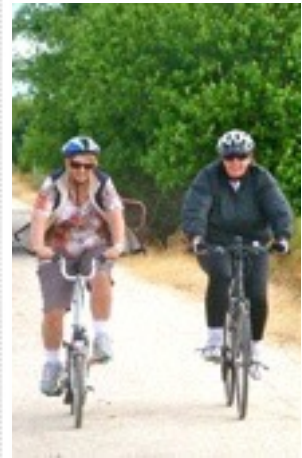
Riding with sister in law