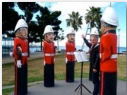
Sig with no musical sense trying to rouse the dumb band.