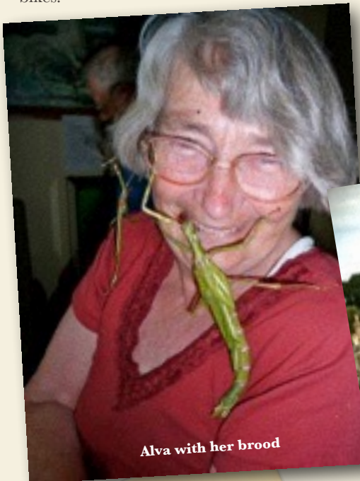
Alva with her brood

The weather was much cooler than Queensland (10 - 16 degrees)